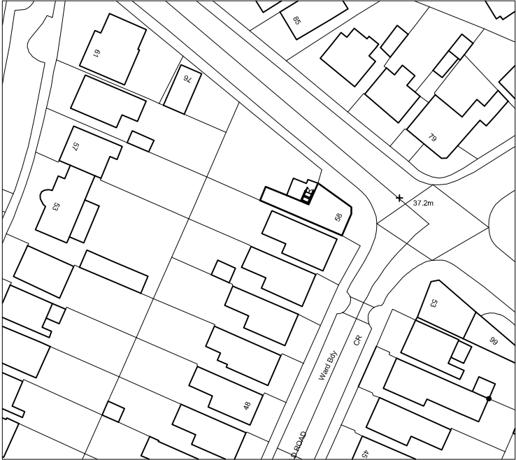
BLOCK PLAN - SCALE 1:500